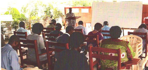
Bible school in southern Ghana (2005)

At the start, AABS offered a curriculum of 48 theological courses, a packet of documents providing guidance to start and operate a Bible school and numerous additional resources for our members. In October 2004 we organized our first annual equipping conference in Ghana attended by 25 school directors. In 2006 we reached the milestone of resourcing member schools in all the regions of Ghana, as well as schools in the countries of Nigeria and Liberia. By 2013 there were hundreds of member Bible Schools equipping leaders in 10 African countries. To hear more growth highlights, you are invited to our annual banquet!