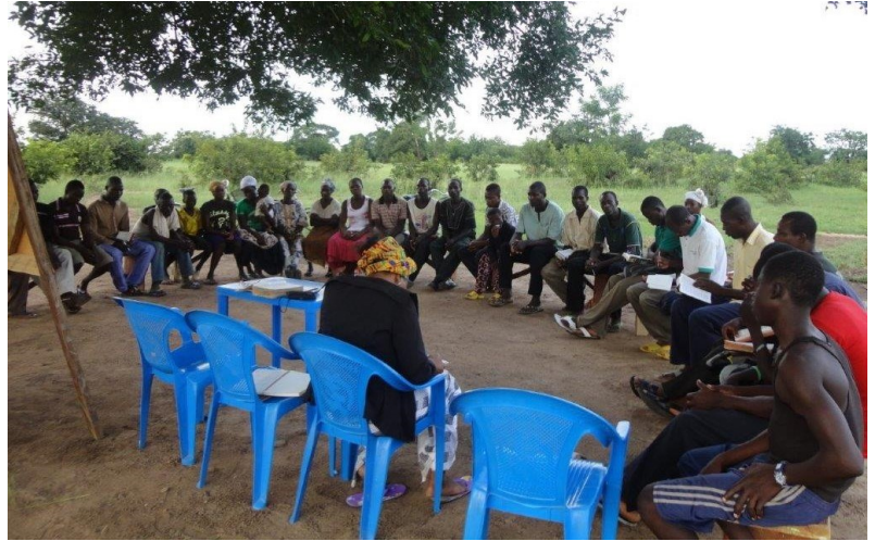
Bible school in northern Ghana (2013)