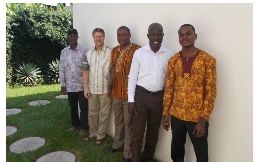
AABS Africa Leadership Team (2011)

We give God all the praise for what He has done and eagerly anticipate what He will continue to do in the future! We hope to see you at our annual banquet, Thursday, October 3rd , to hear more of what God has done and together celebrate His faithfulness and your generosity.